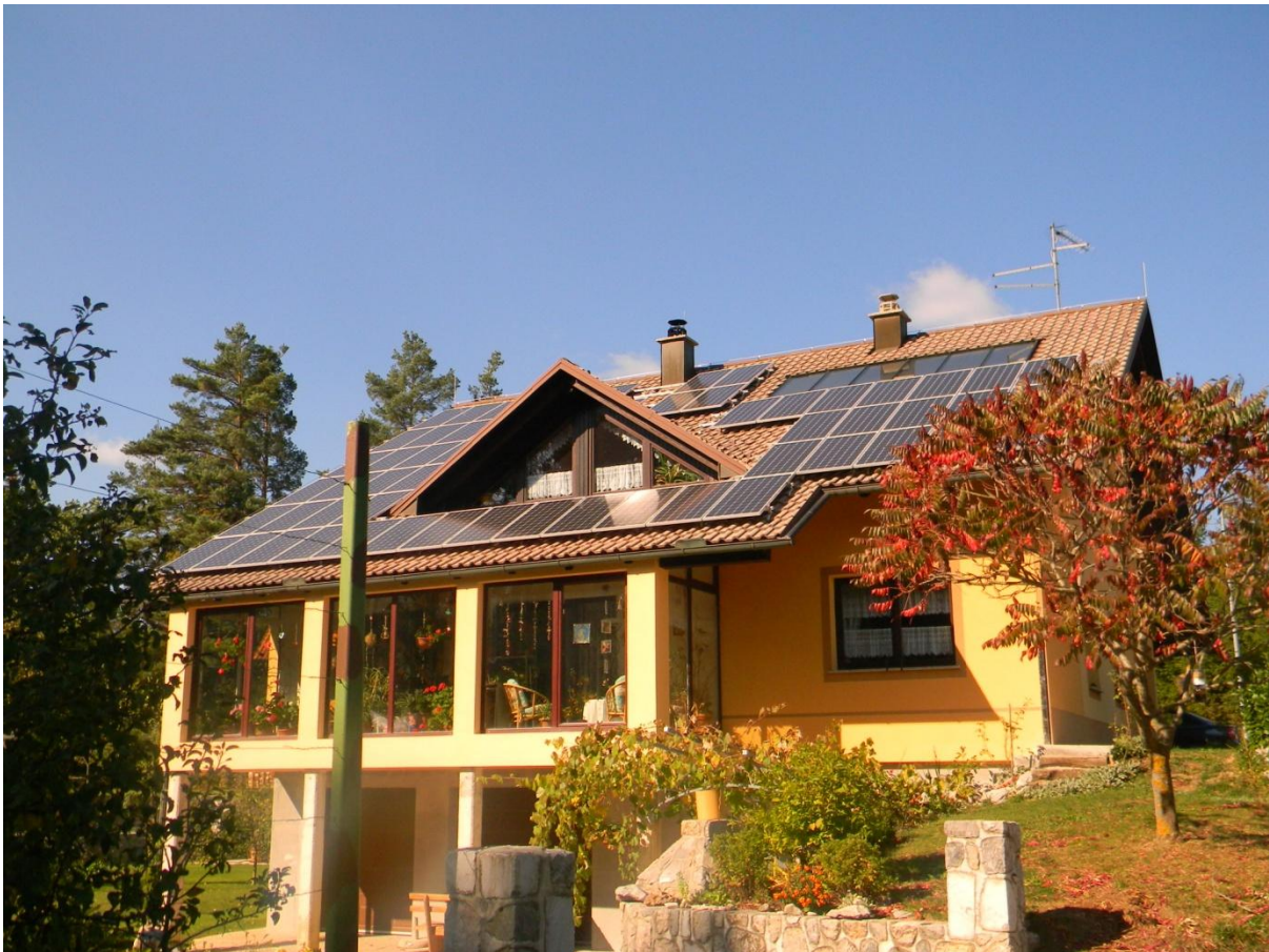
The house at Begunje with 54 PV's and the conservatory with overhanging roof

Solar panels were much commoner in Slovenia than in Scotland and assisted with water heating and boosting the heating systems. Photo voltaic was also installed in one of the houses that we visited although the owner was waiting to get connected to the grid. He has an impressive number of PV's on his roof top and had also designed his house to make use of passive heating. A 2 nd floor conservatory was cleverly designed to be in shade in the summer and full sun in the winter. This house had an old style ceramic stove in their living room where they dried fruits for winter consumption. Their water boiler was connected to the solar panels and despite using oil for fuel their consumption had dropped from 2,000 litres of oil to 600litres per year. They had decided that their next investment was going to be a logwood boiler.