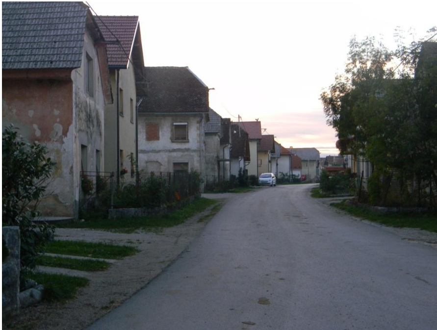
A typical street in Dolenje Jezero

Lake Cerknica lies in a depression of the limestone plateau known as karst which, due to the subterranean caverns results in it being completely drained in autumn due to the low rainfall. We walked around the edge and it was hard to believe that it was the largest lake in Slovenia as it was bone dry. It is protected by European legislation and is one of several Natural sites in Slovenia due to the many species of birds. When we were there in October there should have been water starting to appear in the lake. However it has been the driest summer in a long time and we were able to see the limestone cavern entrances and shallow depth.