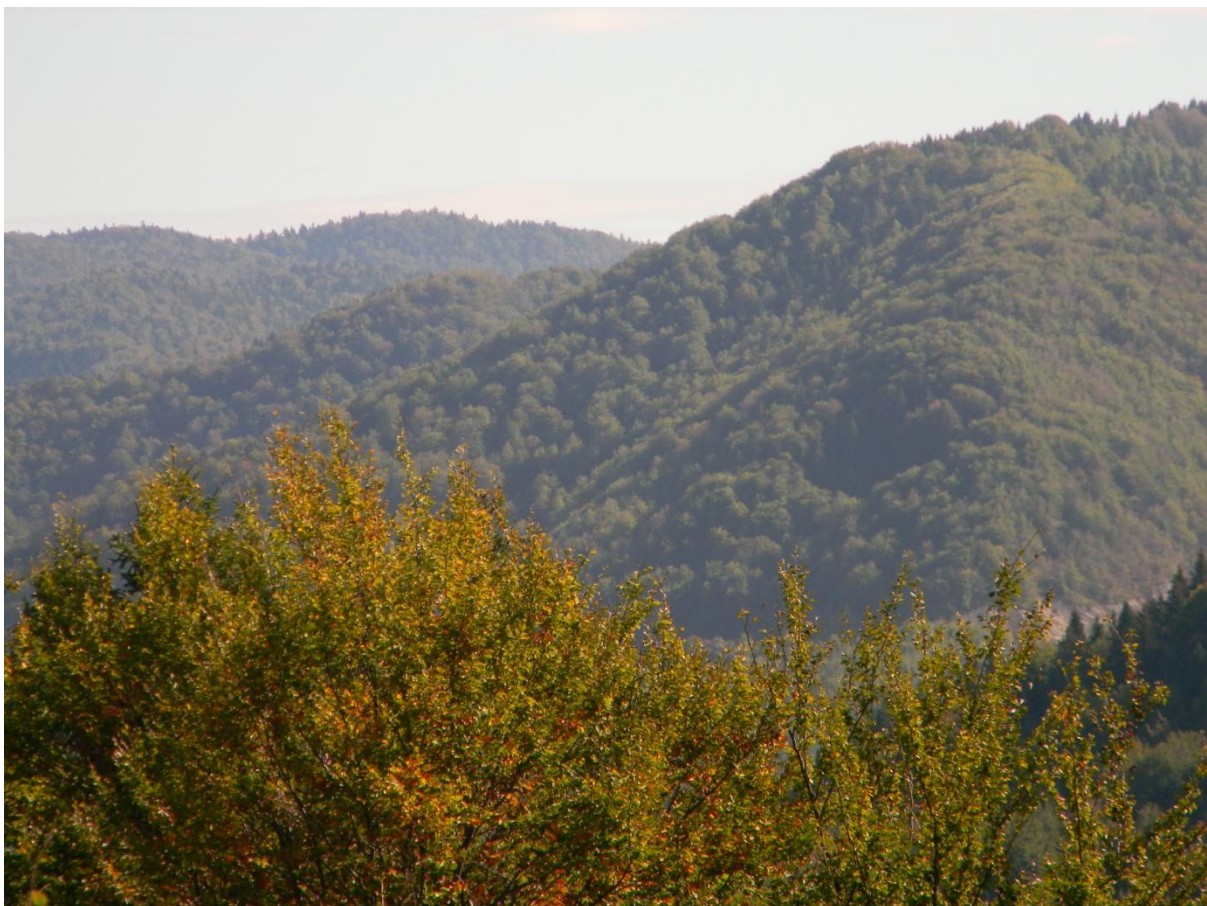
Slovenian natural forest

Over the last fifty years the forest area has increased by 31% and the growing stock by 157%.