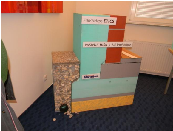
An example of a properly insulated wall