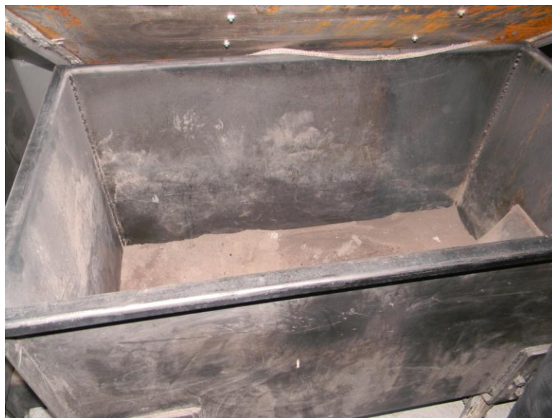
Ash from the 200kW boiler after a week of burning

However I was interested to hear about the fact that they utilised every last bit of the wood source and that ash production was minimal with a shallow amount of ash produced for a 200kW boiler every week. This also means that there is such a little amount of smoke produced that there is not a fine particulate problem in the atmosphere. In Scotland planning authorities are keen to promote biomass as a means of reducing fossil fuel used and to help to reach ambitious Scottish government targets for the Climate Change (Scotland) Act 2009. Particulates are often a reason cited by communities keen not to use biomass. However the examples I saw in Slovenia have helped to alleviate any concerns I had and I will promote these examples of good practice. Biomass in Scotland is also a bit more problematic as often it is waste materials that are promoted as the “fuel” source which create a different variety of concerns.