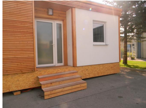
a kit house

Windows in new builds appear to be triple glazed as standard practice and at an average price of €1000 per window with spruce frames I was costing out how much it would be for me to hire a van and purchase some wooden triple glazed windows for my old cottage in Scotland! Not only that the windows we saw being produced had no trickle vents. Instead there was an option to open the windows by 3mm to provide ventilation. Historical Scotland would be delighted.