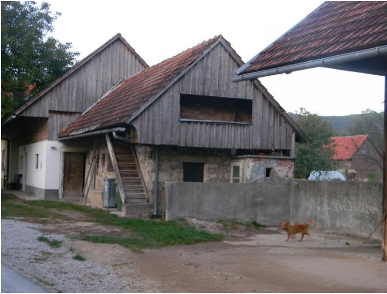
Combination of old and new at Dolenje Jezero