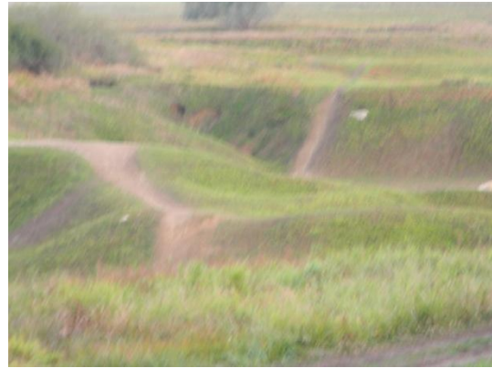
Lake Ceknica showing the limestone base and many paths created in the dry season